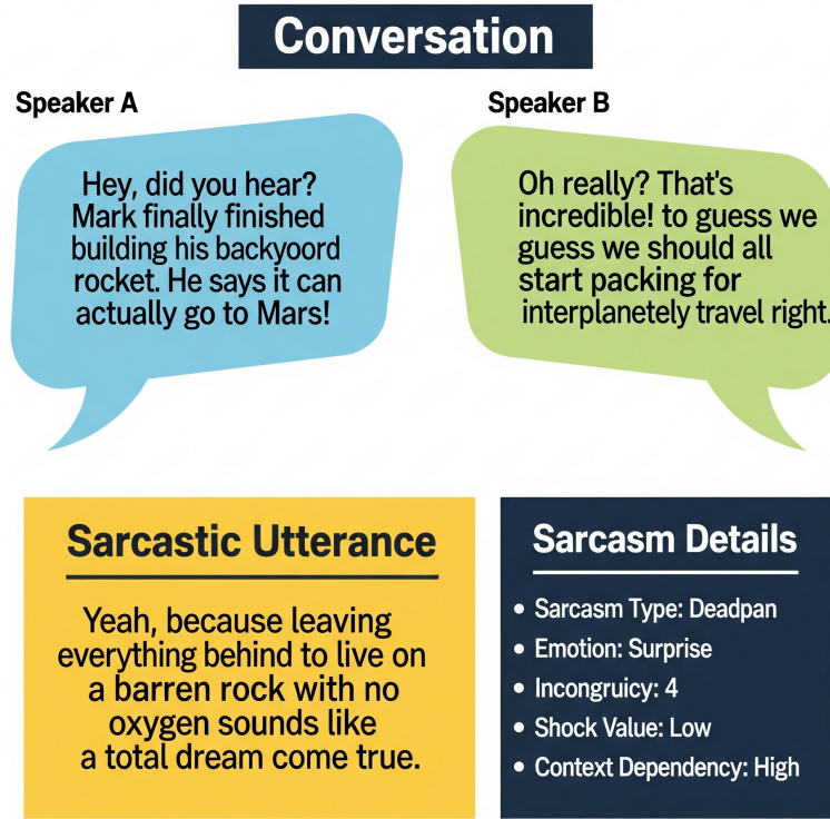
Figure 3: Sample Output Using Emotion-based Generation Method